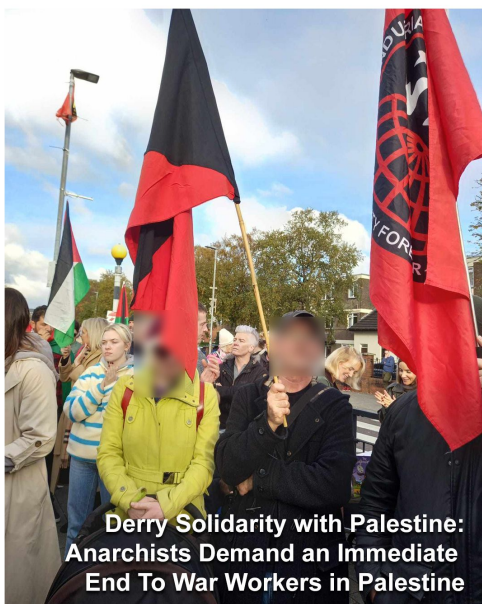
Derry Solidarity with Palestine: Anarchists Demand an Immediate End To War Workers in Palestine

For more details please visit our site: derryradicalbookfair.wordpress.com